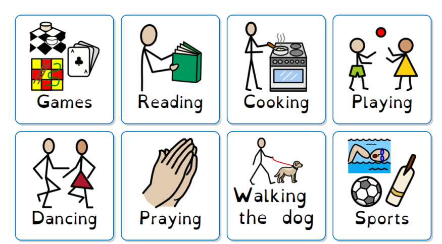
How do you connect with others?

Next week is Children's Mental Health week! This year's theme is "Connection". We have asked all children to think about how they connect with people at home or in the community. We would love to see any photos or drawings of these ways of connecting. A house point will be awarded for each contribution and some may be shared in class or in assembly on Friday.