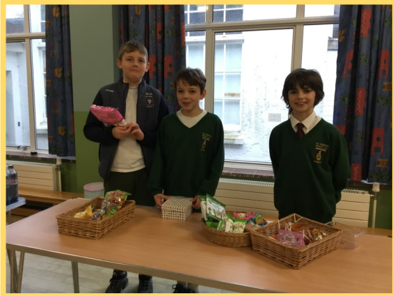
The Bake Sale