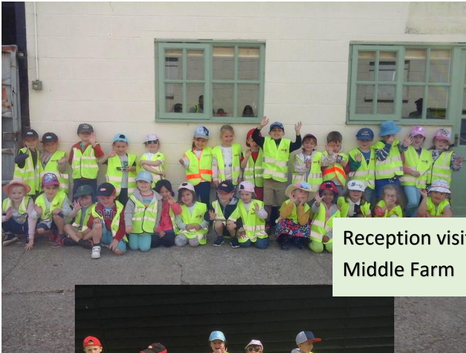
Reception visit Middle Farm