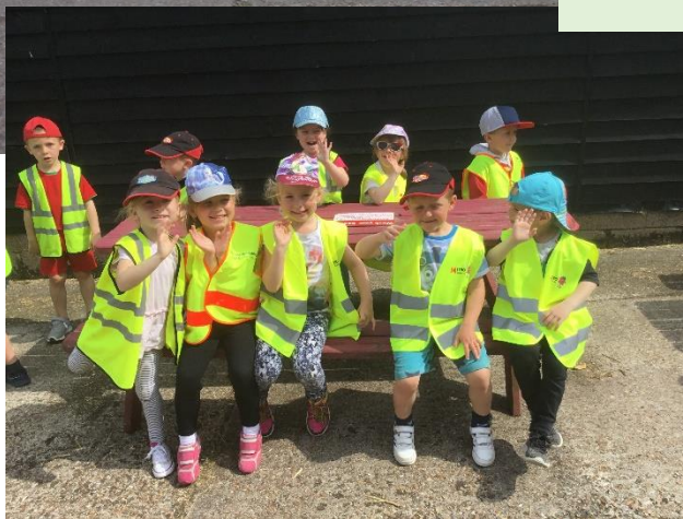
Loud Shirt Day