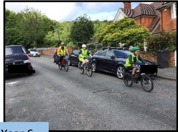
Year 5 & Year 6 Level 2 Cycling