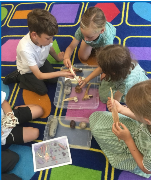
Year 2 were budding historians this afternoon. They observed some incredibly old artefacts and thought about what they could be, how old they were and who they might belong to. They thought about why 'archaeology is rubbish', thinking about what we could find out about a person from the rubbish they throw away. There was lots of great discussion and