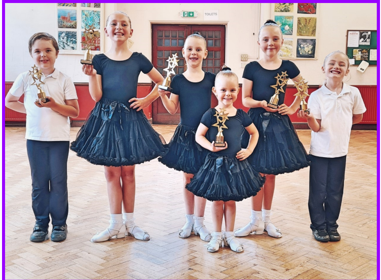
St John's Meads pupils at ISADO International Dance Academy "receiving their Golden Star Award" trophies at a ceremony this week. The children were amazing and true Superstars!