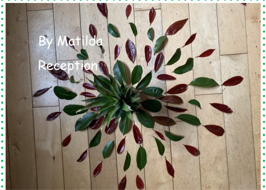
By Matilda Reception