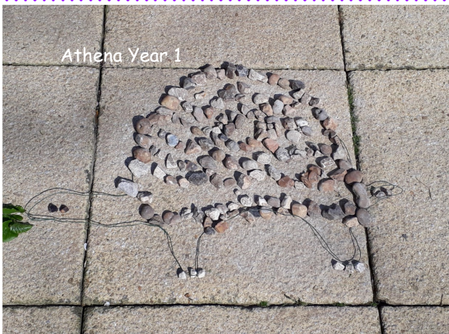
Athena Year 1