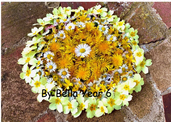
By Bella Year 6