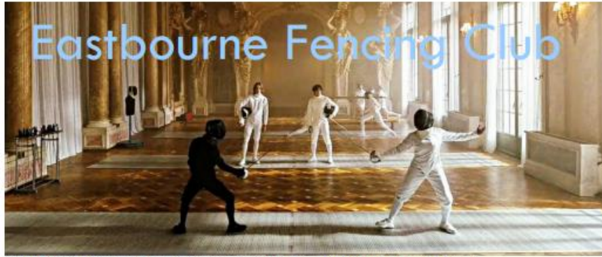
© Image from Wednesday the Netflix series. Eastbourne Fencing Club looks like a school gym...