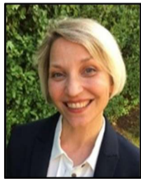
HR/People Ops Manager & Trust Safeguarding Lead Trust DSL